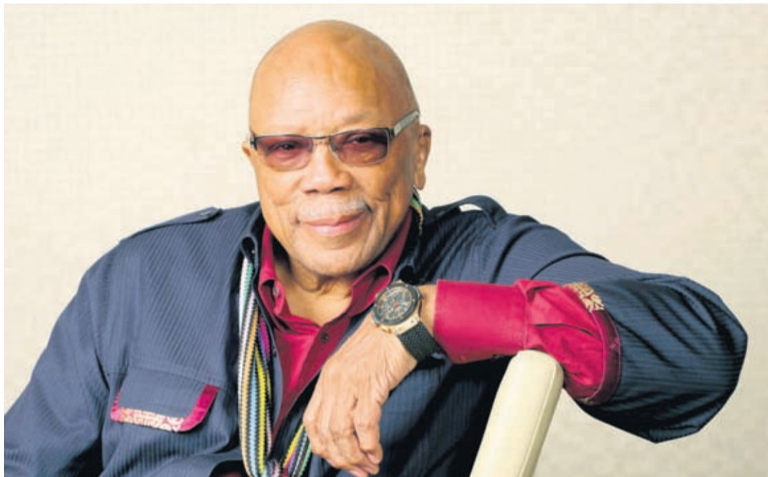
Music producer Quincy Jones poses for a portrait to promote his documentary "Quincy" during the Toronto Film Festival on Sept. 7, 2018, in Toronto.